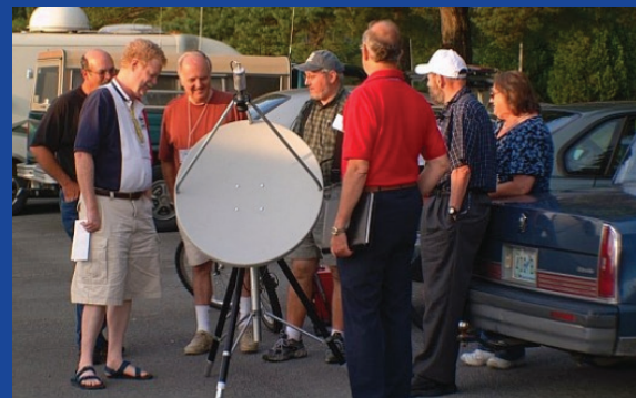
SARA Members discussing the IBT (Itty Bitty Telescope)